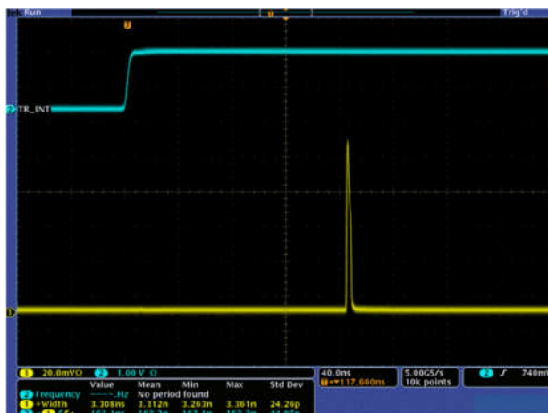
Top trace: external trigger Bottom trace: laser output pulse